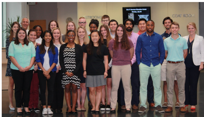
Summer 2018 ASPIRE Students

The ASPIRE program is open to undergraduate students over the age of 18 in the summer before their sophomore, junior, or senior years. Applications are open November 1 - February 20, 2018. Visit crtc.wustl.edu/aspire or call 314-454-8956 for more information.